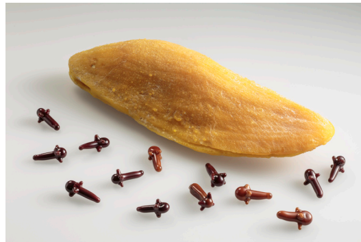
Mango Seed, 2017 Murano glass, cera persa, approx. 12 x 4.5 x 3.5 cm Cloves, 2017 Murano glass, lume, approx. 1.5 x 0.5 x 0.5 cm