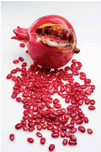
Pomegranate, 2017 Murano glass, soffiato, 13 x 10 x 10 cm Pomegranate Seeds, 2017 Murano glass, lume, 1.3 x 1 x 0.5 cm each

For high res images contact Judi Harvest +1-212-960-3100 judiharvest@gmail.com judiharvest.com