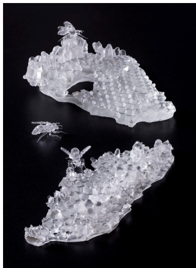
Frozen Honeycomb I, 2017 Murano glass, cera persa, cristallo, 14 x 10 x 3 cm Frozen Honeycomb II, 2017 Murano glass, cera persa, cristallo, 13 x 5 x 3 cm Frozen Bees, 2017 Murano glass, lume, cristallo, approx. 2.5 x 2 x 1.7 cm

Page 1: Seed Universe , 2017, Murano glass, cera persa , lume , and soffiato , various dimensions.